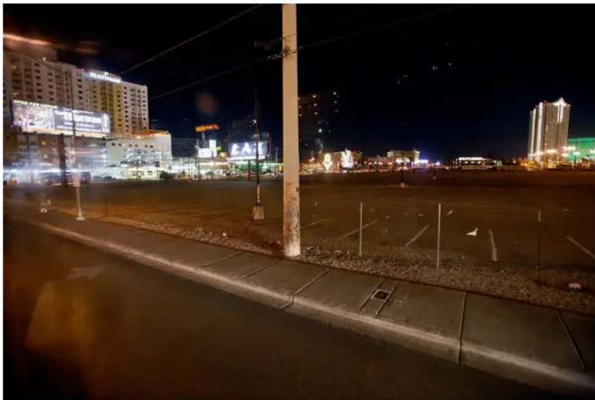
The location where rapper Tupac Shakur was murdered, near the intersection of Flamingo Road and Koval Lane in Las Vegas.