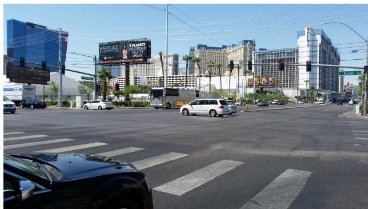
The intersection of Koval Lane and Flamingo Blvd as it is today. His car was where that bus is sitting.