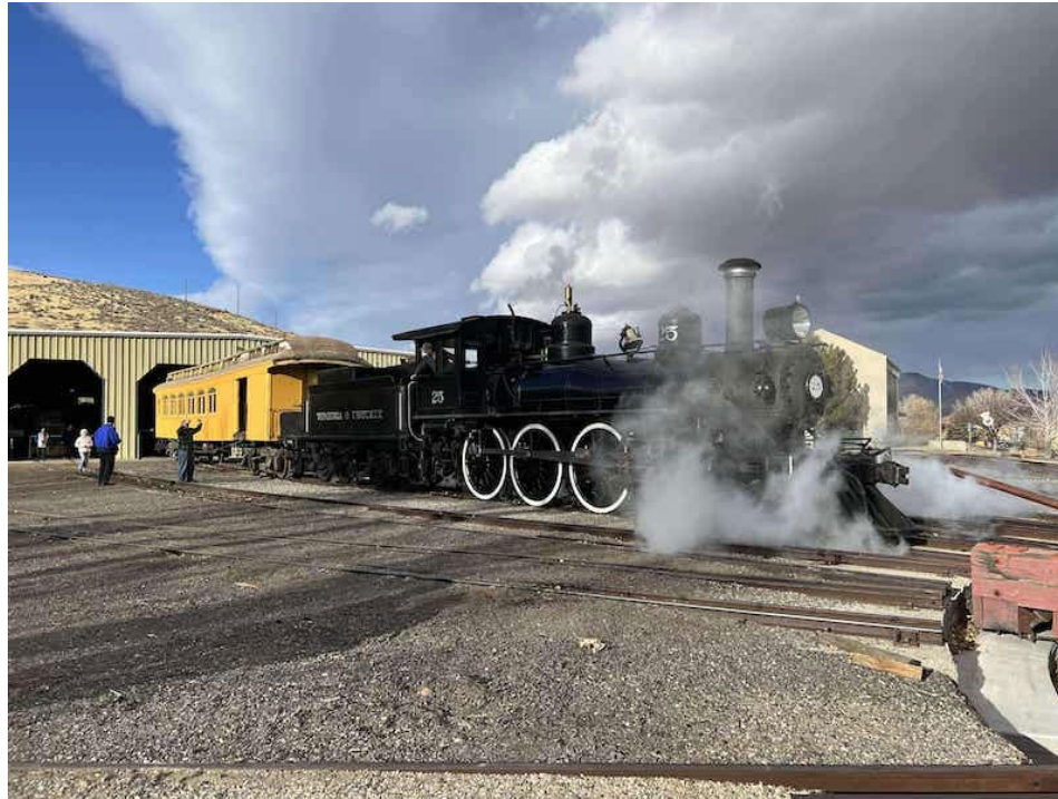
V&T25 backs Car 20 into the Carson City Shop on December 12.