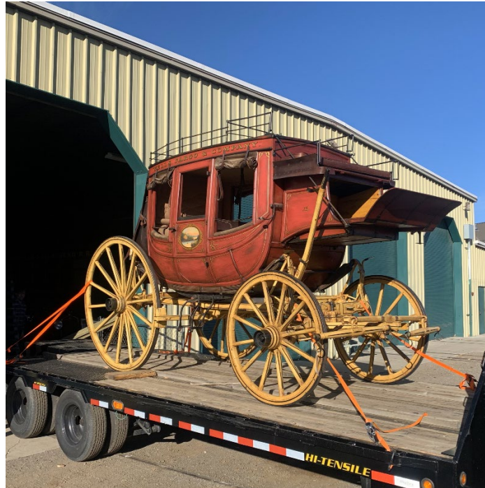
Stagecoach Arriving at the Nevada State Railroad Museum December 3, 2024.